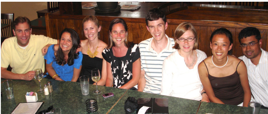
Members of the class of 2004 spend time together in Charlottesville during their reunion.